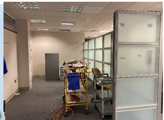
Creating and building the new classroom.