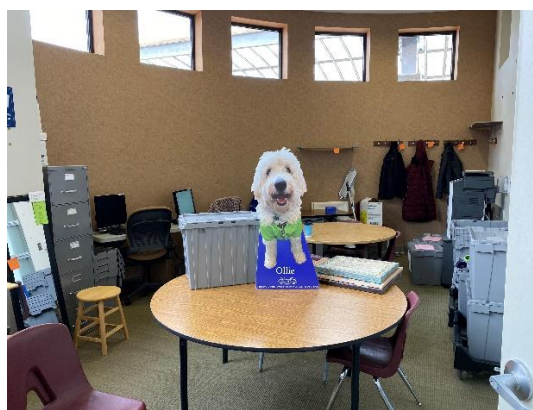
Old Classroom – Prepping to move

Spring break provides an opportunity to renew and re-energize for the last leg of Project SEARCH, as the interns give it their all in their last rotation. This spring break return presented the interns with a new classroom location within the hospital. The new location is in the lower level of the hospital across from the business offices. The move has been a lesson of safety first 😊 paired with defining the meaning of synergy in working together to create a better space mixed with a creative vision and flexibility. And even though we know change is hard...change is growth!!! Change is good!!! Thank you to EVERYONE who made this possible, we are so grateful!!!